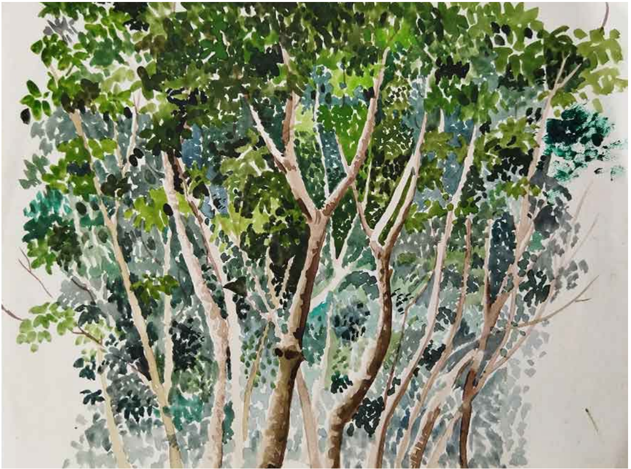
STUDY 05 | 21 cm X 29.7cm | Watercolour | 2024