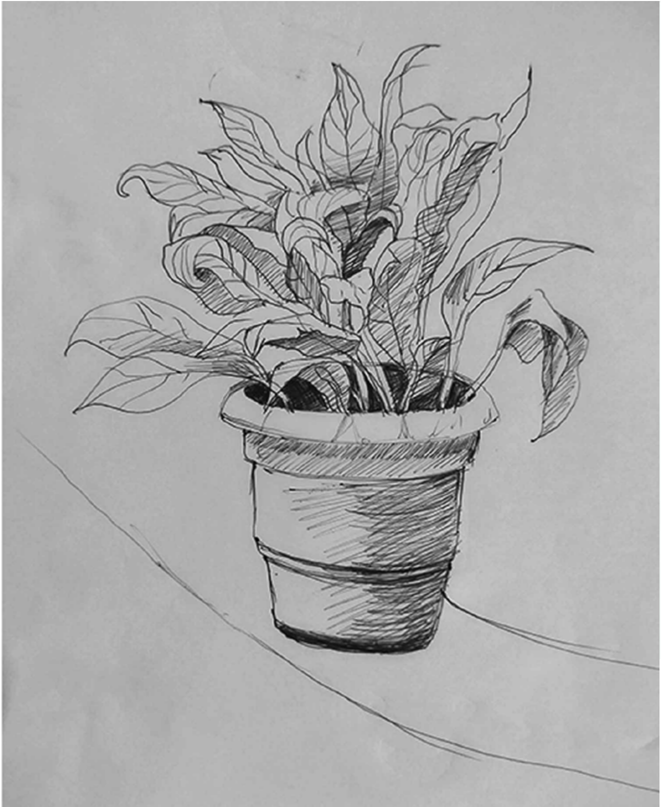
STUDY 08 | 21cm X 27.7cm | Pen on paper | 2024