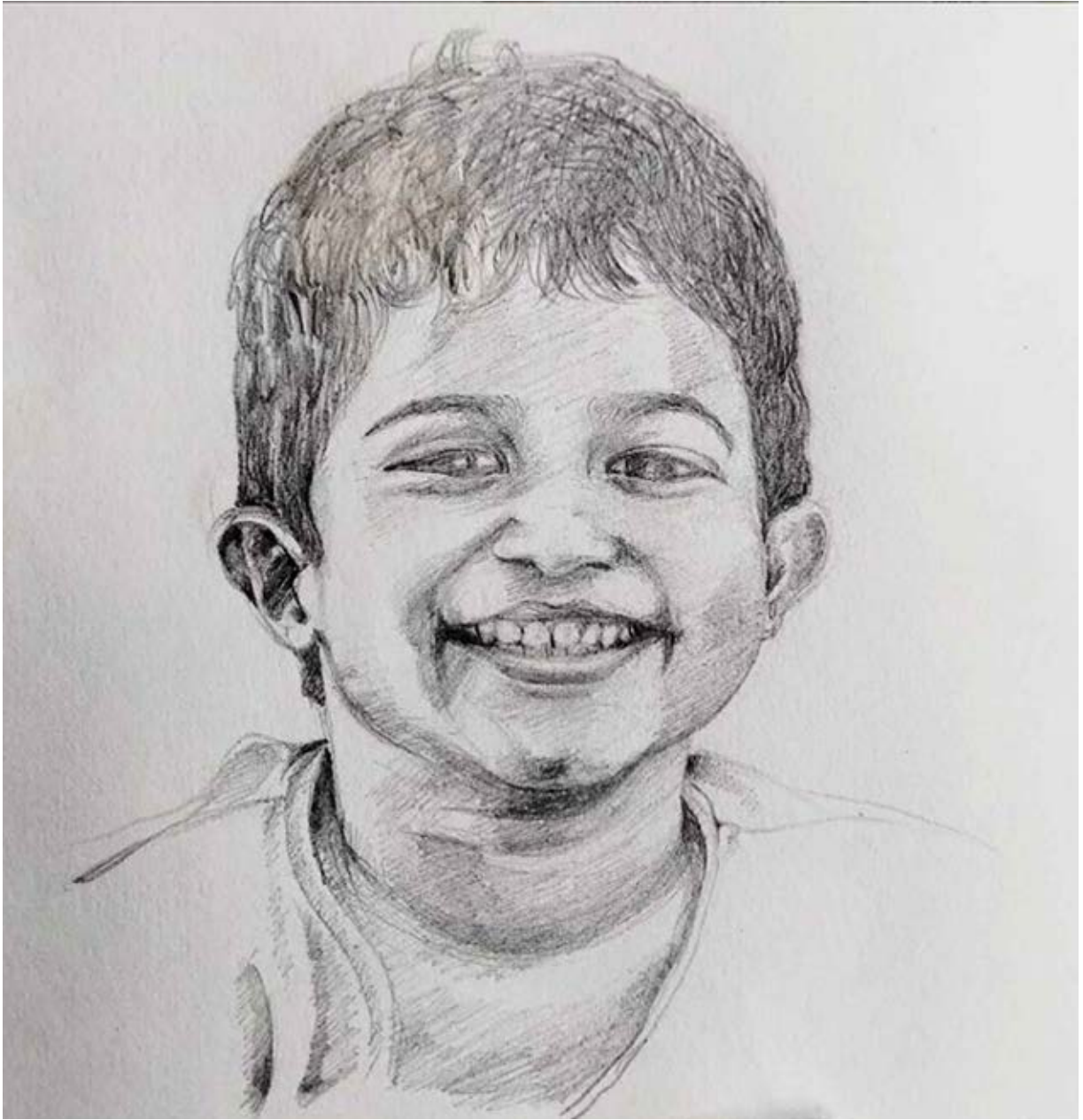
SYRUS | 21 cm X 14cm | Pencil on Paper | 2024