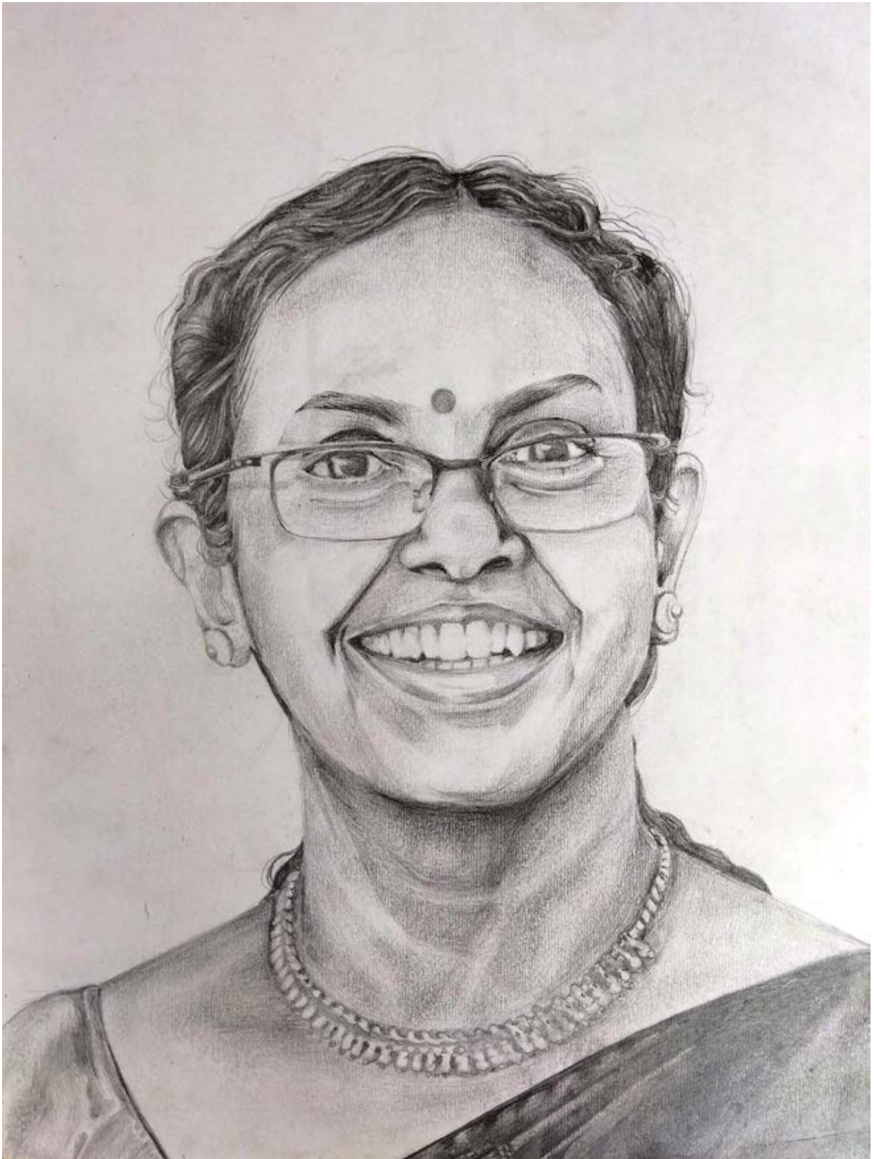
MOTHER | 42 cm X 29.7cm | Pencil on Paper | 2024