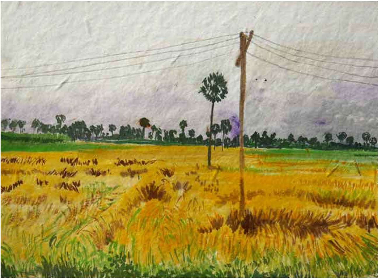
STUDY 04 | 20 cm X 13cm | Watercolour | 2024