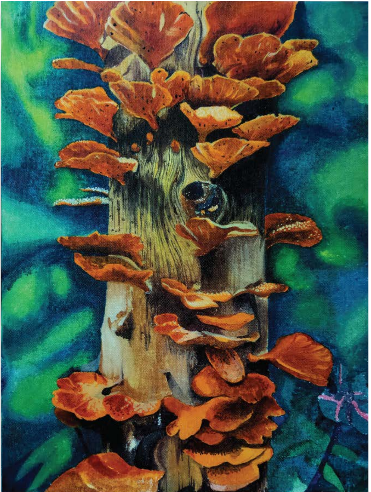
UNTITLED | 29.7cm X 42cm | Acrylic on Canvas | 2024