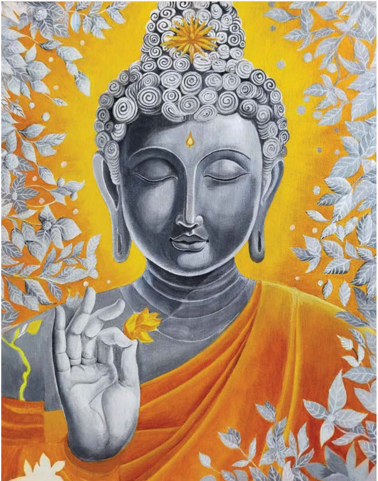
BUDDHA | 42cm X 59.4cm | Acrylic on Canvas | 2024