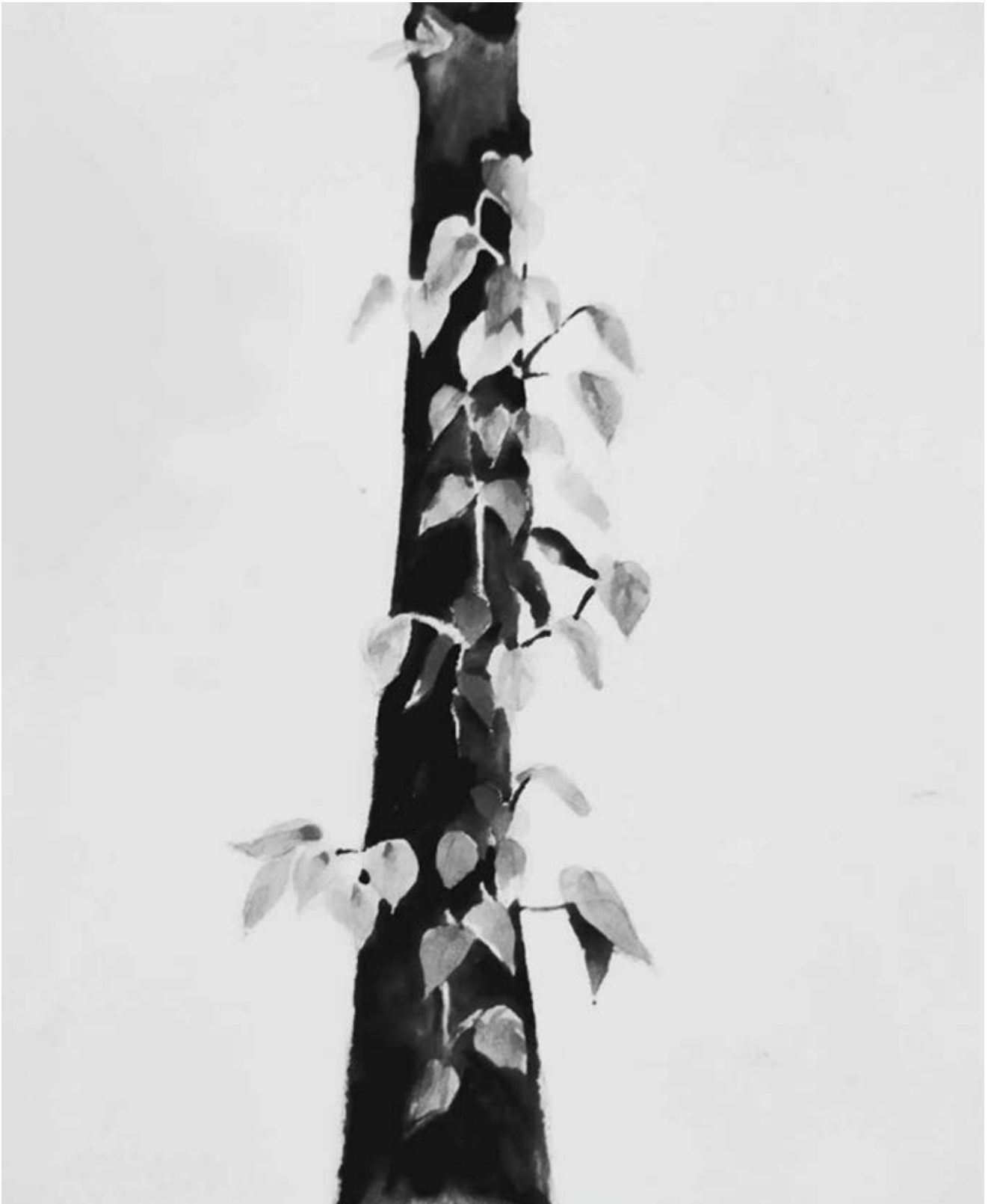
STUDY 02 | 21 cm X 14cm | Watercolour | 2024