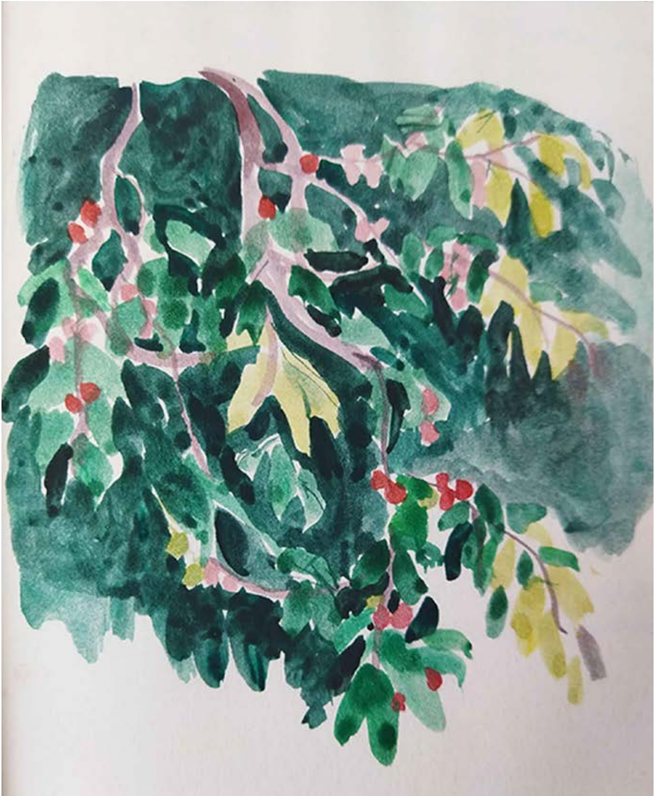
STUDY 07 | 13cm X 15cm | Watercolour | 2024