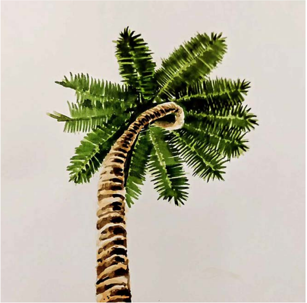
KALPAVRIKSHA | 29.7cm X 21cm | Watercolour on Paper | 2024