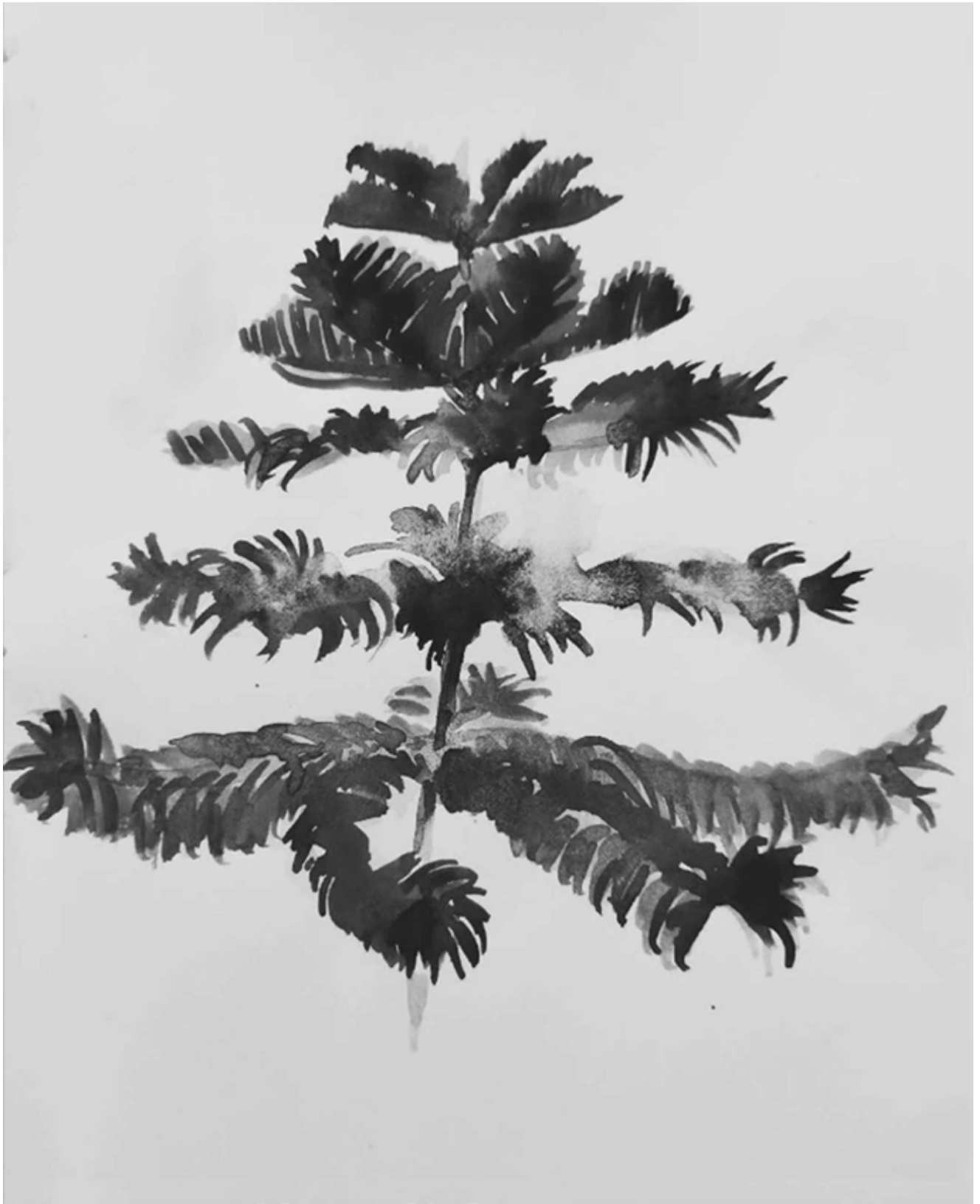
STUDY 03 | 21 cm X 14cm | Watercolour | 2024