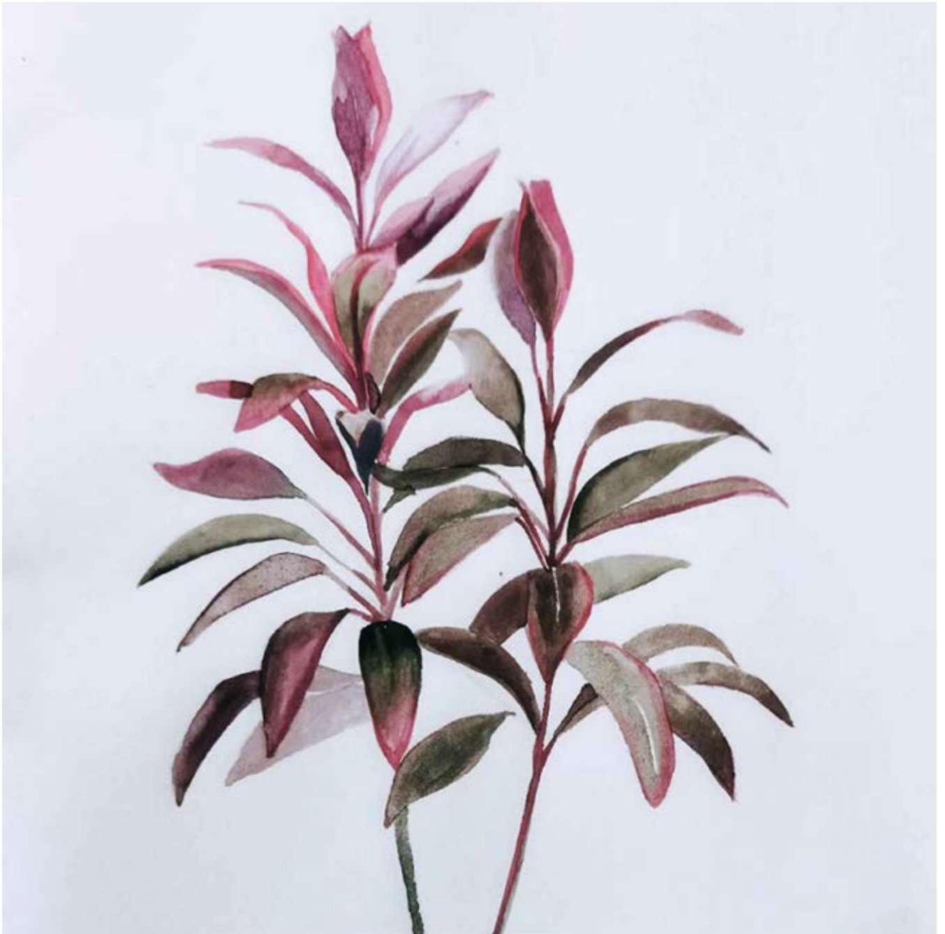
STUDY 01 | 21 cm X 14cm | Watercolour | 2024