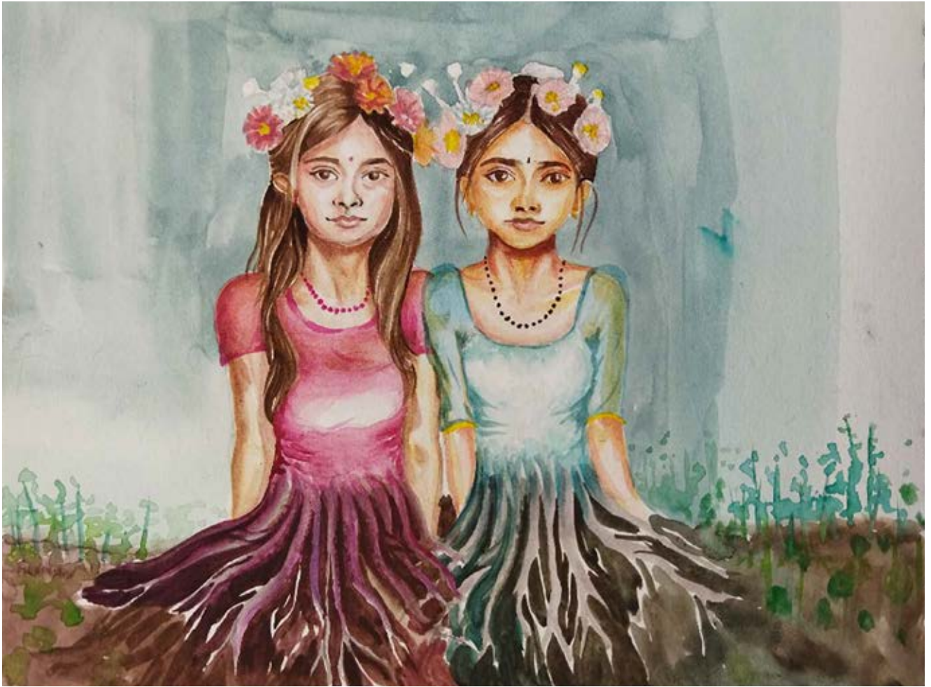
CULTIVATION | 21cm X 29.7cm | Watercolour | 2025