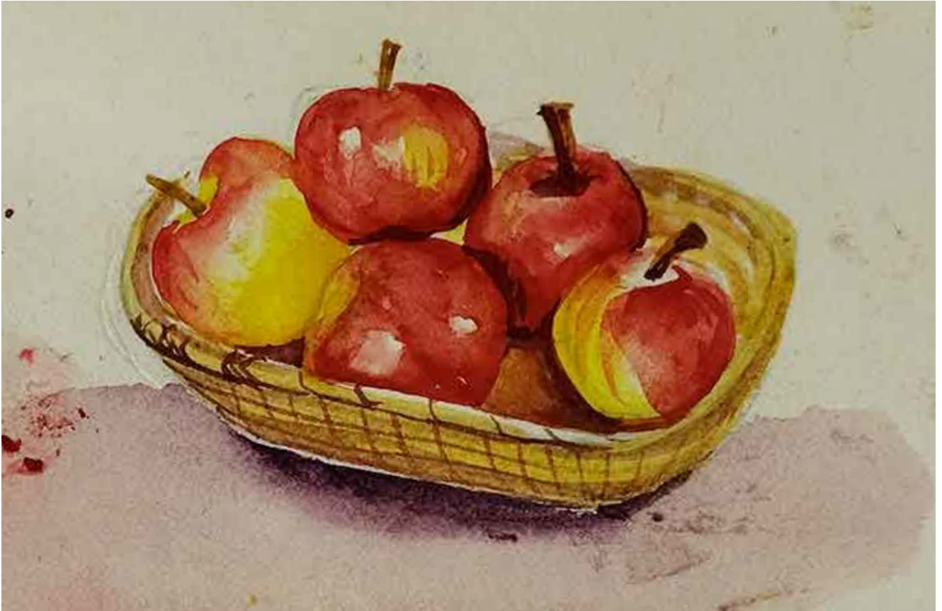
STUDY 06 | 10.5cm X 7cm | Watercolour | 2024