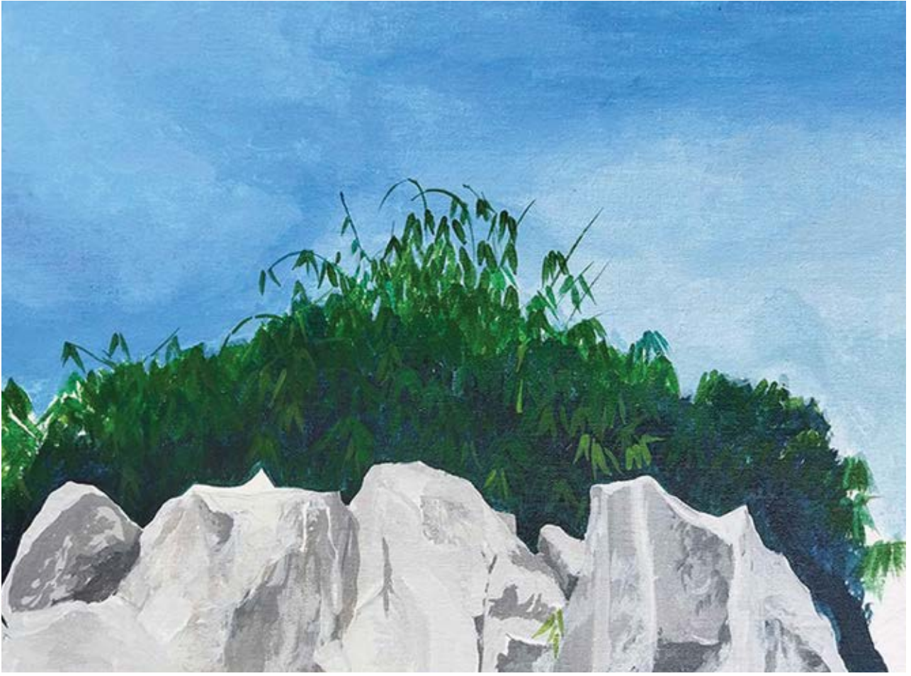
ROCKS | 29.7cm X 42cm | Acrylic on Canvas | 2025