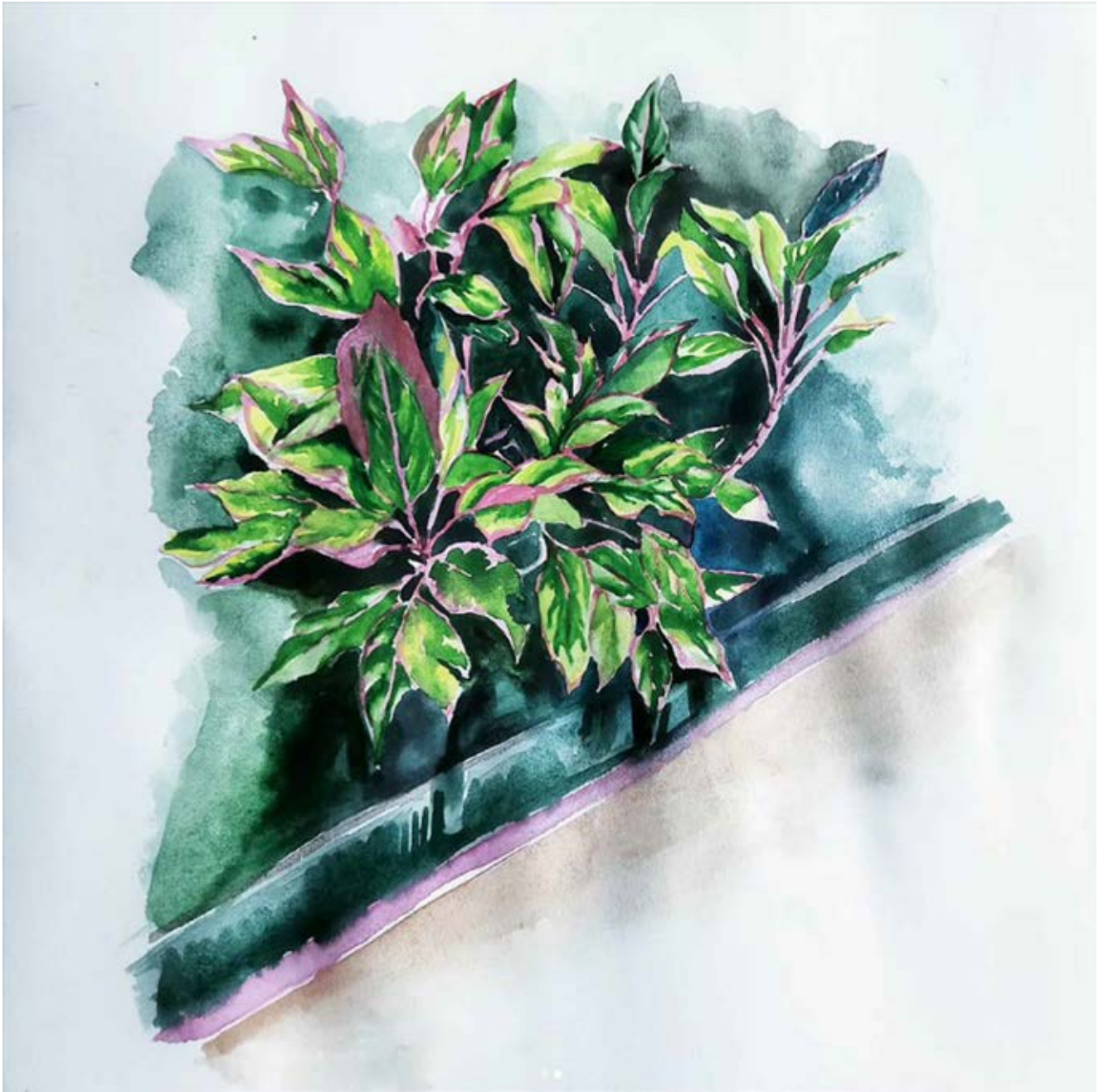
STUDY 08 | 13cm X 15cm | Watercolour | 2024